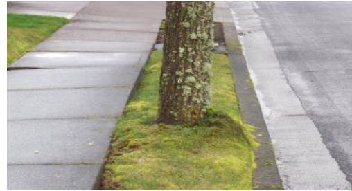
Narrow planter strips create challenging conditions for trees