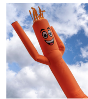
Air Blown Signs