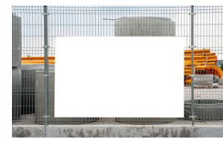
Signs on Fences