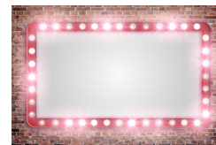
Animated, Flashing, or Rotating Signs