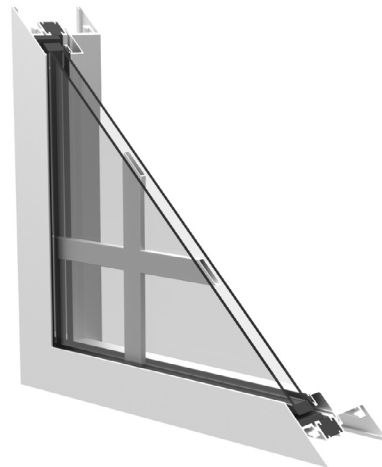
Window with interior grid (not permitted)

Further information about the HRB and HRB Policies can be found at: www.oregoncity.org/planning/hrb-policies