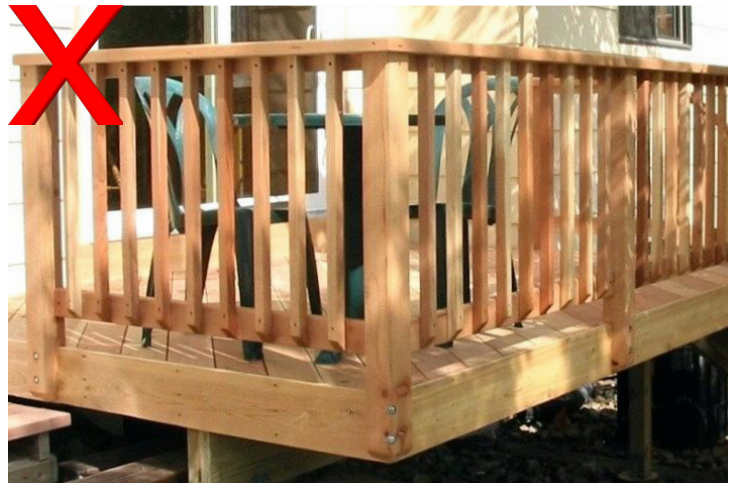
Balusters attached on the side of the rails (not permitted)

Further information about the HRB and HRB Policies can be found at: www.orcity.org/planning/hrb-policies